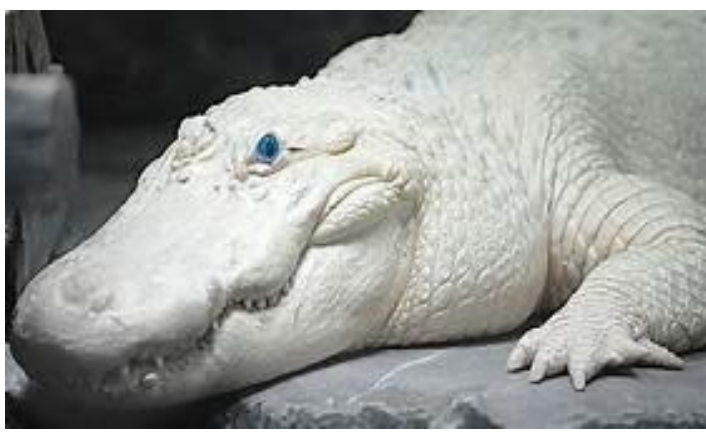
"Old Blue Eyes," soul piercing ocean blue, shining white teeth that would make steak out of you and me, in a heartbeat!